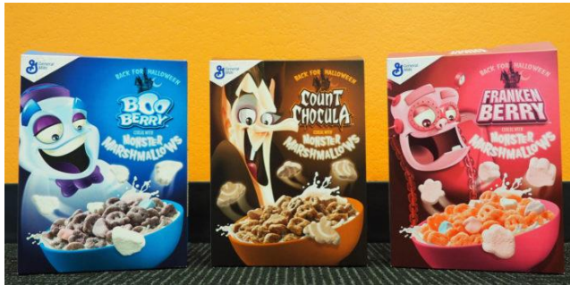
3 types of cereal

The following items are available for breakfast: