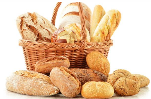
6 types of breads

How many ways a breakfast can be prepared if exactly 2 items are selected from 2 different groups?