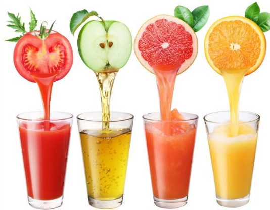
4 types of juices