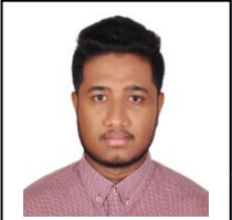
HEAD OF MARKETING OFFICER