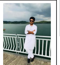
EXECUTIVE FINANCE OFFICER