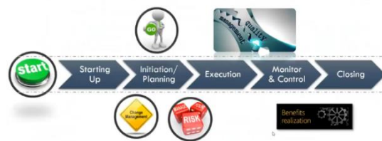
Figure 2 Process of project management

With proper project management, an individual could efficiently utilize his knowledge, skills, tools, and techniques to conduct a project. Project management helps a person to clarify the problem statement in a project and plan the solution based on the person's capability. In other words, it allows a person to evaluate the cost, time, and energy needed for the project. In this way, he could decide whether he requires extra resources to secure the benefit from the project, or tailoring the process by achieving the minimum project requirement without disregarding the project quality so the project is always cost-effective. Project management proposes the individual to keep track of the progress in the project so measures could be taken at once if any problem occurs. Eventually, it is