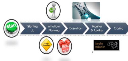
Fig. 2. A Simplified Version of Prince2. In a project, there is always a Starting Up which is a starting point. Next, the initiation part and the planning part. Then, execute the project. Once the project is executed, then project will be monitored and controlled in order to achieve the expected quality, the quality is also controlled and the risk is managed properly. Lastly, the closing of the project where this process is to ensure that the goals and objectives are being achieved.[4]