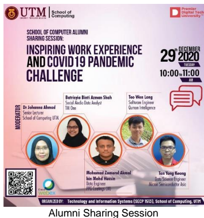
Alumni Sharing Session