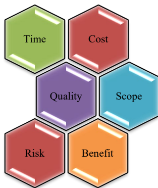
Importance of Project Management