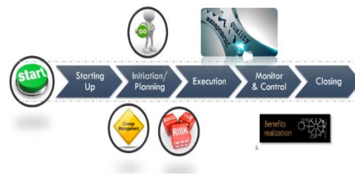
Fig. 2. A Simplified Version of Prince2. In a project, there is always a Starting Up which is a starting point. Next, the initiation part and the planning part. Then, execute the project. Once the project is executed, then project will be monitored and controlled in order to achieve the expected quality, the quality is also controlled and the risk is managed properly. Lastly, the closing of the project where this process is to ensure that the goals and objectives are being achieved.[4]