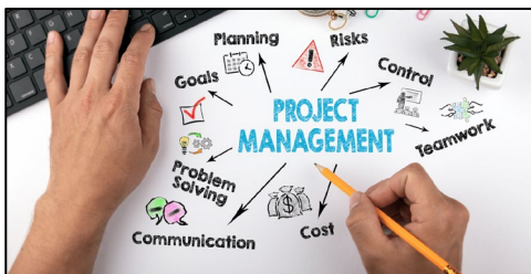
Figure 1: Aspects of an IT Project

From the talk, we know that IT Project Management is very important for an IT project. According to the talk, a project has many aspects to consider executing the project successfully.