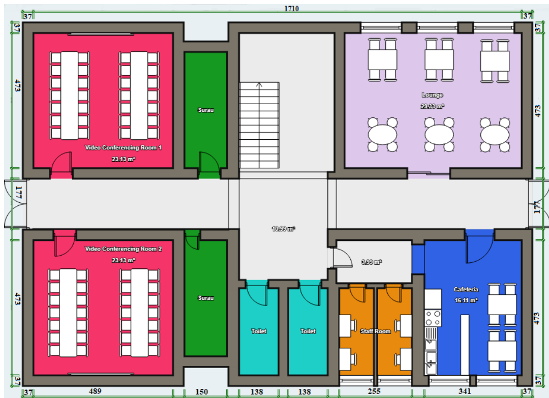
Figure 1 : Floor Plan for Ground Floor 1