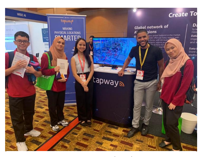
Visit Tapway booth

their peak hour and which region has many people to select the best region to set up the booth to get maximum profit. Besides, it can trace humidity, temperature, and vibration which will alert people whenever there is something uncommon happens, such as earthquakes, tsunami, etc.