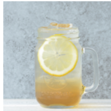
PEACHY LEMON GRASS RM 10

Blame the sun! Our climate are sometimes too much to bear, we agree. But that doesn't mean we have to compromise comfort. Just chill with these ice, ice baby!