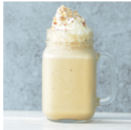
CARAMEL LATTE FRAPPE RM 15