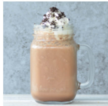
MOCHA FRAPPE RM 15

All price are included with 10% service charge and 6% SST.