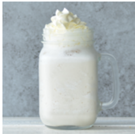
PEACHY BANANA RM 15