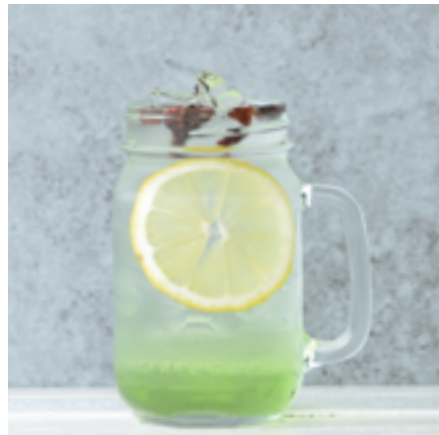
SPICY APPLE RM 10