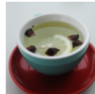
SPICY APPLE RM 9.40