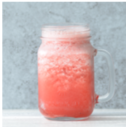
STRAWBERRY PEACH RM 15