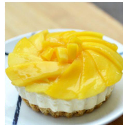
MANGO CHEESE CAKE