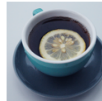
PEACHY LEMONGRASS RM 9.40