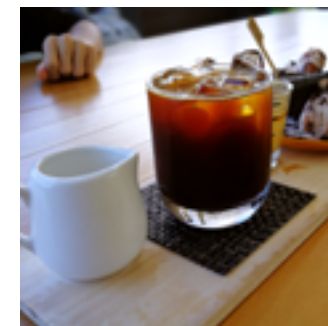
BLACK ELEMENT RM 12.20