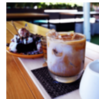
WHITE ELEMENT RM 14.10