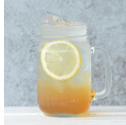
MANGO PEACH RM 10