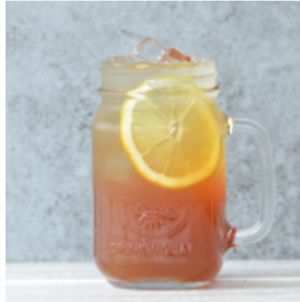
ICE LEMON TEA RM 10