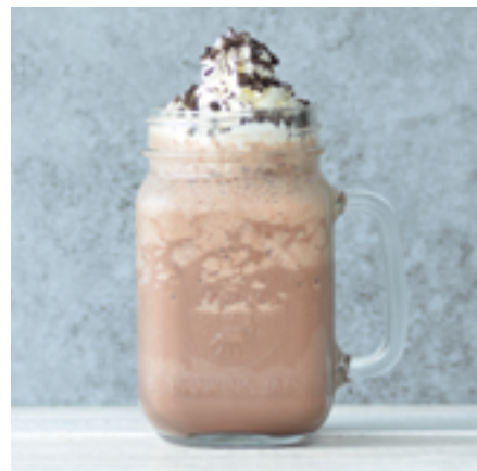
CHOCOLATE MINT RM 15