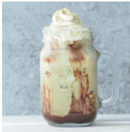
MATCHA CHOCOLATE RM 15