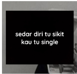
Table 3 Types of Memes