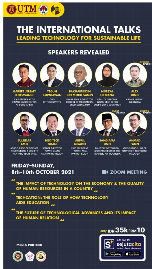
Figure 1. Talkshow Speakers Poster

The seminar event International Talks has outstanding speakers who will each cover a distinct subtopic related to education, economics, or social humanity. From 8 th to 10 th October 2021, International Student Society (ISS) Indonesia hosted this online event. This program intends to serve as a resource for all international students interested in learning about sustainable living technology and serving as a resource for all international students interested in learning about sustainable living technology.