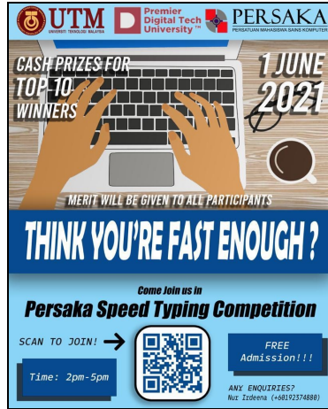
Figure 1: Poster of the program