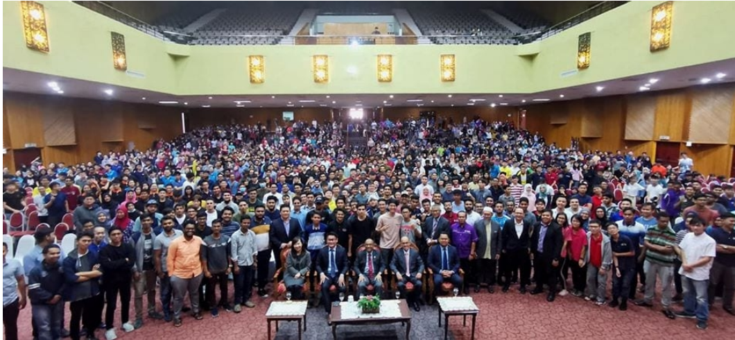
Image 1 : All of Student from School of Computing with Management from Huawei