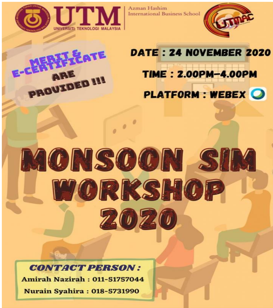
Poster Monsoon SIM Workshop