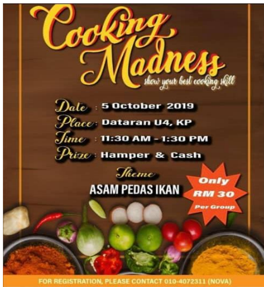
Poster Cooking Madness