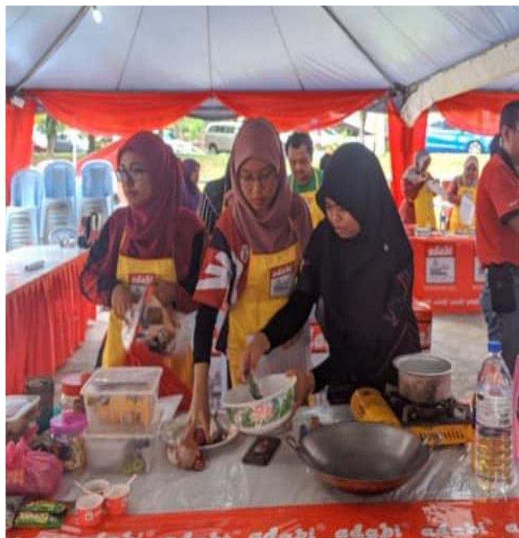
Picture during the competition