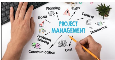
Figure 1: Aspects of an IT Project

From the talk, we know that IT Project Management is very important for an IT project. According to the talk, a project has many aspects to consider executing the project successfully.