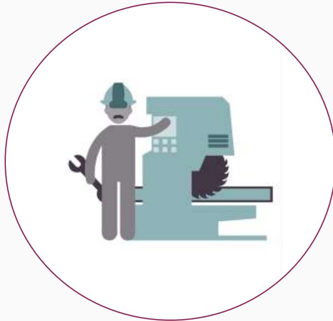
Operator View Live Demonstration